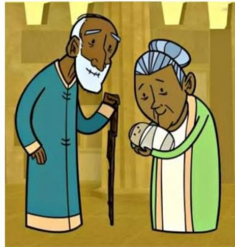
Simeon And Anna

Please join us for this informal service Everyone is welcome and we hope to see you there Refreshments will be served after the service