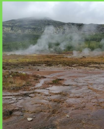
Iceland August 2022